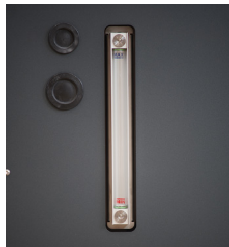
Recovery/distillation unit. Double chamber: one for distillation, one used for reservoir.