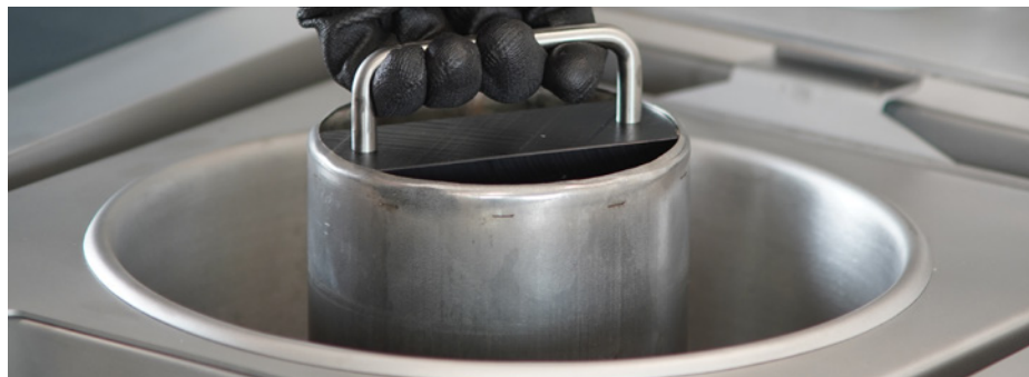
Placing the centrifuge cup into the centrifuge unit