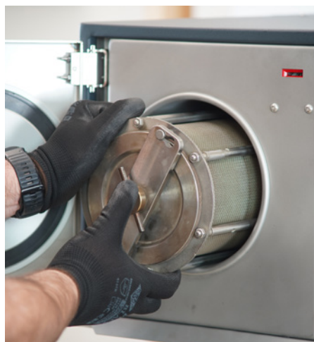
Placing the washing drum into the machine