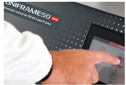
Detail of the 7" touchscreen display