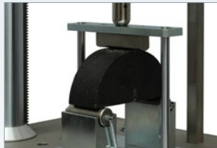
AASHTO TP124 Method B (Illinois FIT)