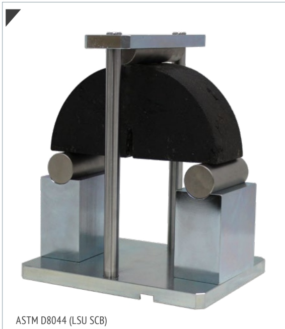
ASTM D8044 (LSU SCB)

IPC Global's Semi-Circular Bend (SCB) Kits have been designed and engineered to further increase the capabilities of your Universal Testing Machine, AsphaltQube or Asphalt Standards Tester.