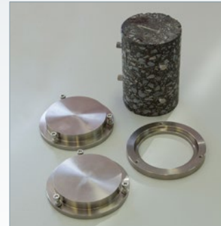
Uniaxial Fatigue platens and tension ring (specimen not included)