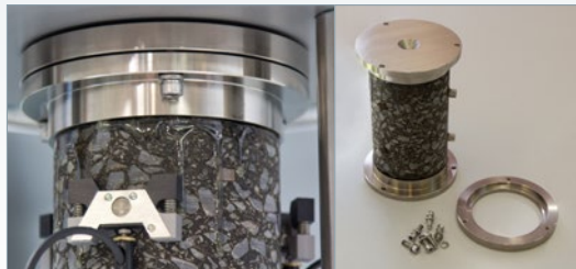
Uniaxial Fatigue Kit

IPC Global's superior UTS software is known for its simplicity in use, clarity of results and analytical power. UTS Software allows for real time graphing of results and configurable real time transducer levels screen, as well as customisable test templates to streamline the testing process.