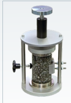
Tension Platen Gluing Jig (specimen not included)

IPC Global offers a wide variety of accessories to extend the range of their advanced testing machines. The range includes fixtures for performing a variety of tests to local and international standards, displacement transducers and specimen preparation equipment. IPC Global's accessories are constructed of high quality robust materials thus ensuring superior performance and appearance for years to come.