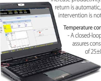
Typical screenshot of the machine software

For technical specifications please refer to page 7.