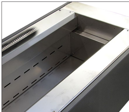
Detail of the stainless steel water bath with the protection for the lateral driving screw rods, by stainless steel too.

This model fully satisfies and exceeds ASTM D113, ASTM D6084, AASTHO T51 and EN 13398 requirements. To obtain the required 25°C with \pm 0.2^\circ\text{C} tolerance, circulation of cold water is necessary. A water chiller (see accessory 81-PV1002) is ideal for this and may already be available in the laboratory but mains water can also be used. If the ambient temperature goes over 25°C, as in tropical areas, and cold mains water is not available, the use of a water chiller is mandatory.