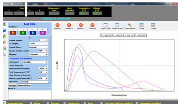
Typical screenshot of the machine software

As the high performance version 81-PV10B02, this research model is PC controlled using dedicated software.