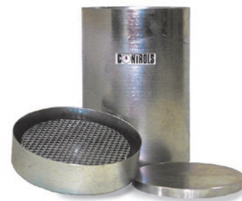
48-D0457: Metal can for thawing and freezing aggregates