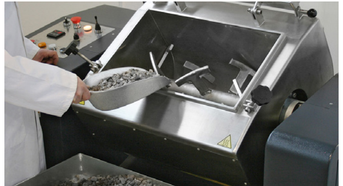
77-PV0077/C Detail of aggregate loading