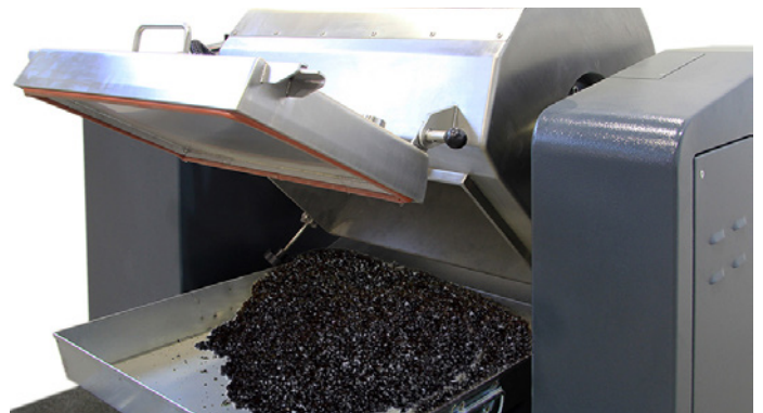
77-PV0077/C Detail of unloading. The mixing cylinder is rotated by a motorized tilting system for easy unloading. The tilting angle is adjustable to 130° to speed up the unloading operation