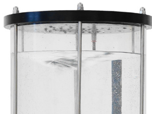
Initial water vortex during cavitation and vacuum application